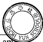
Acting Principal, Liu Hang Lam Chi Yun School